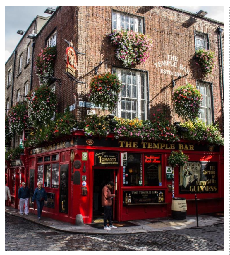
13 Days • 18 Meals: 11 Breakfasts, 7 Dinners

HIGHLIGHTS... Dublin, Irish Evening, Kilkenny, Waterford, Choice on Tour: Waterford Crystal Factory or Waterford Medieval Museum and Wine Vault, Blarney Castle, Boat Tour, Ring of Kerry, Cliffs of Moher, Farm Visit, Galway, Donegal Town, Derry, Giant's Causeway, Glens of Antrim, Belfast, "Titanic Experience"